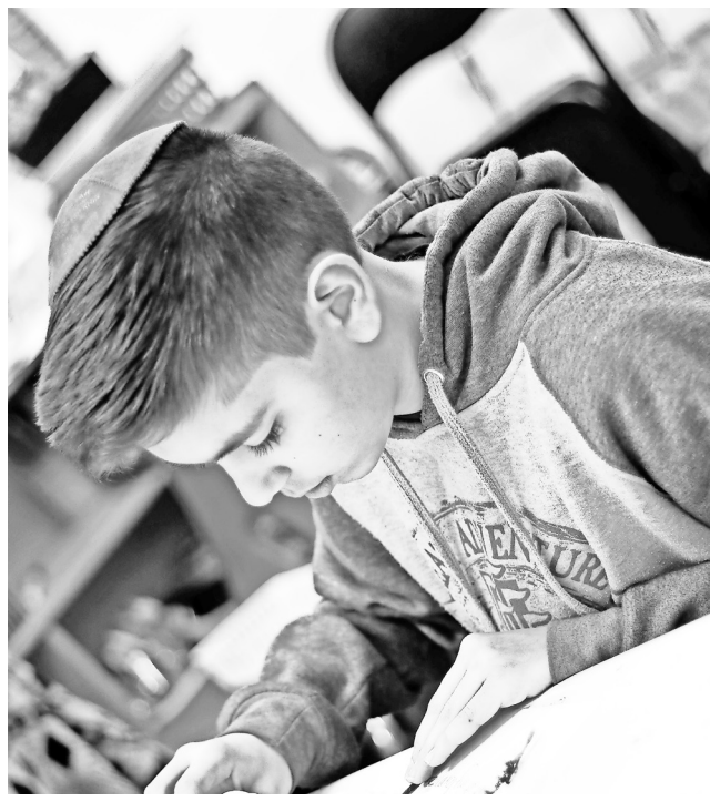
Students in the Bar and Mat Mitzvah class at the Chabad of Bellmore, Merrick and Wantagh memorialized the victims and survivors of the holocaust on Jan. 27, International Holocaust Remembrance Day.