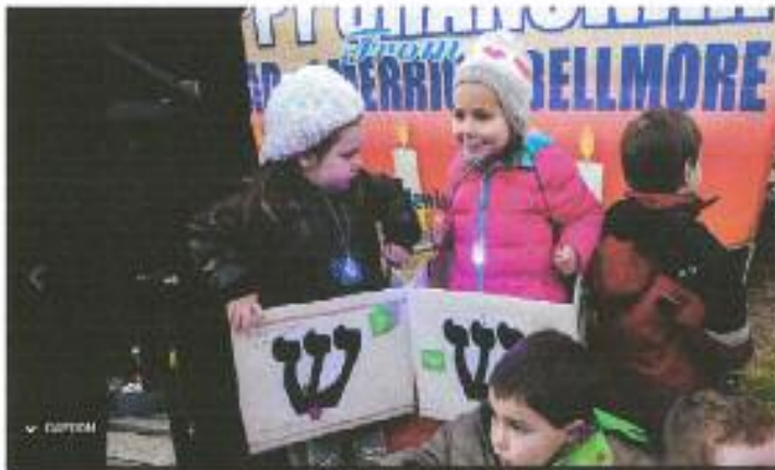
Kids are dressed as dreidels to perform during "The Chanukah Experience" hosted by the Chabad of Merrick Bellmore-Wantagh December 20, 2016 7:10 PM

Merrick Hanukkah celebration features latke fry-off, songs