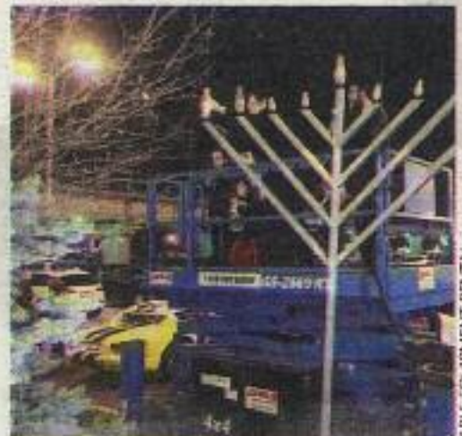
ABLE EQUIPMENT RENTAL