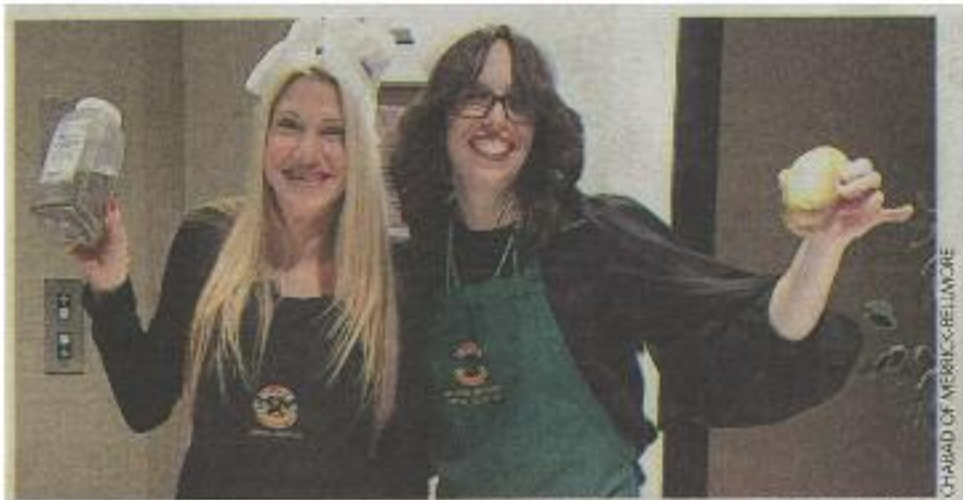
CHABAD OF MERRICK-BELLINGHAME